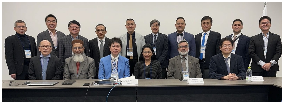
Council of Delegates in Nagasaki on April 26, 2024