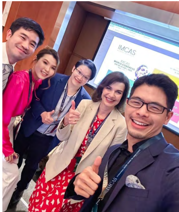
IMCAS World Congress 2025