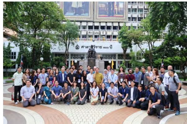
ASAN-SIRIRAJ Reconstruction of Lower Extremity Workshop 2024