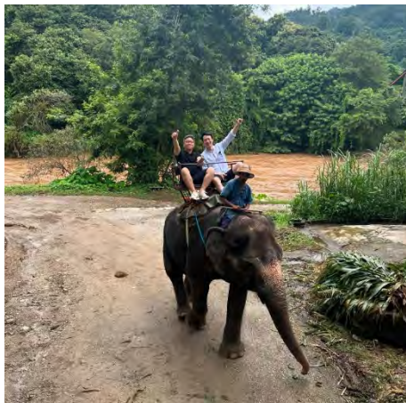
ThSAPS meeting in Chaingmai 2024