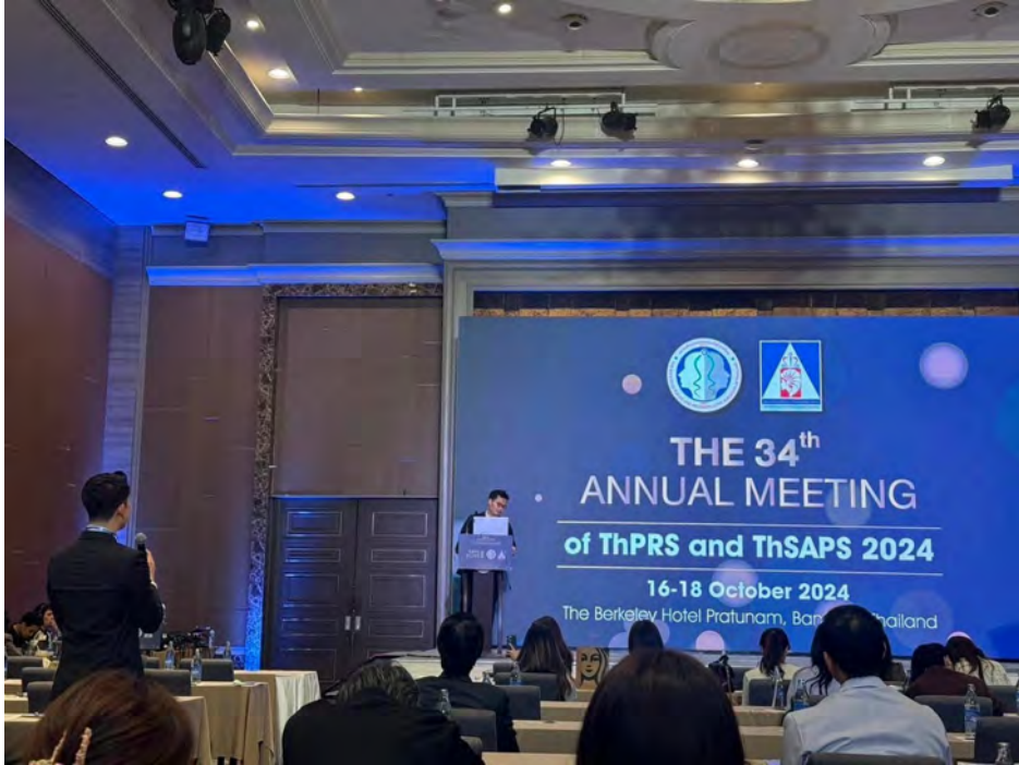
The 34 th Annual Meeting of ThPRS and ThSAPs 2024