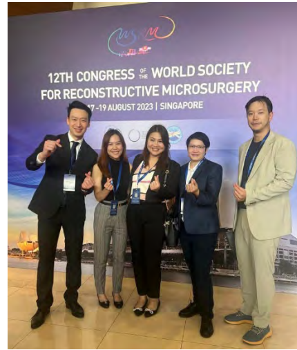
12 th Congress World Society for Reconstructive Microsurgery 2023 (WSRM 2023)