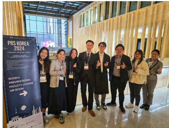
PRS KOREA 2023, 2024