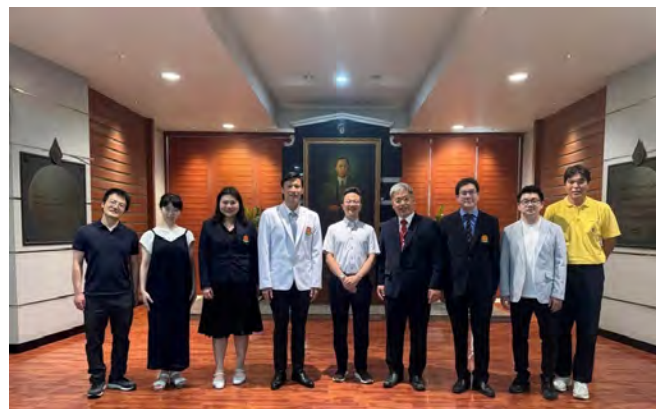
ICG Lymphography Workshop Hands-on ultrasound workshops demonstrative cadaveric dissection and live surgery