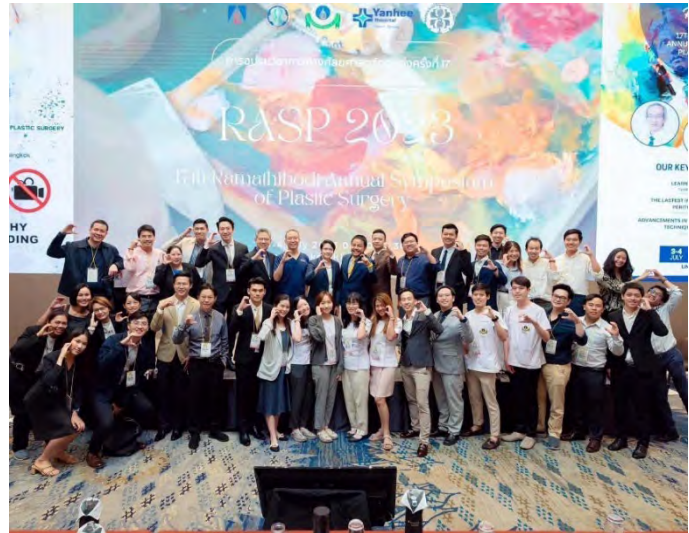
17 th Rama Thibodi Annual Symposium of Plastic Surgery (RASP2023)