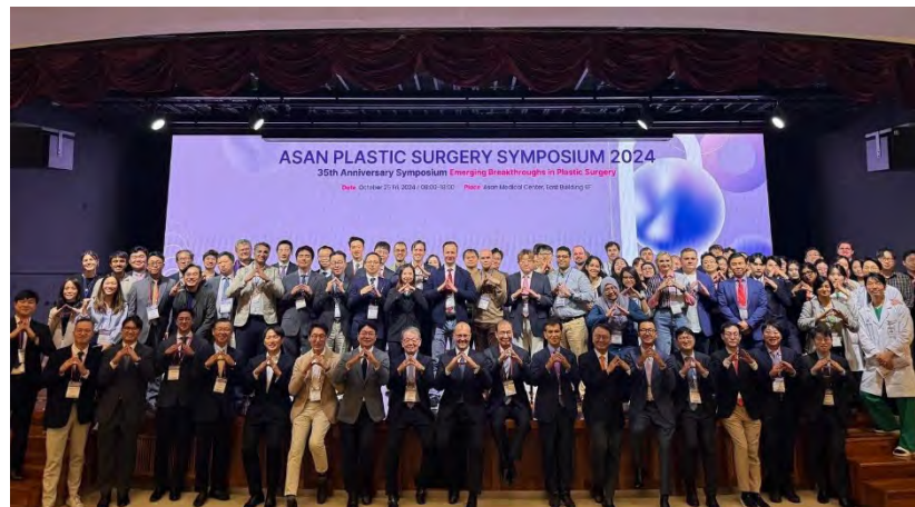
ASAN Plastic Surgery Symposium 2024