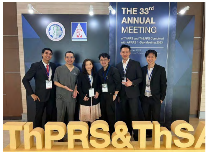
The 33 rd Annual Meeting of ThPRS and ThSAPs combined with APRAS 2023